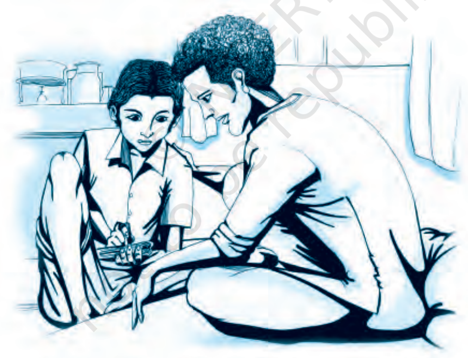
The Thief's Story

It was quite pleasant working for Anil. I made the tea in the morning and then would take my time buying the day's supplies, usually making a profit of about a rupee a day. I think he knew I made a little money this way but he did not seem to mind.